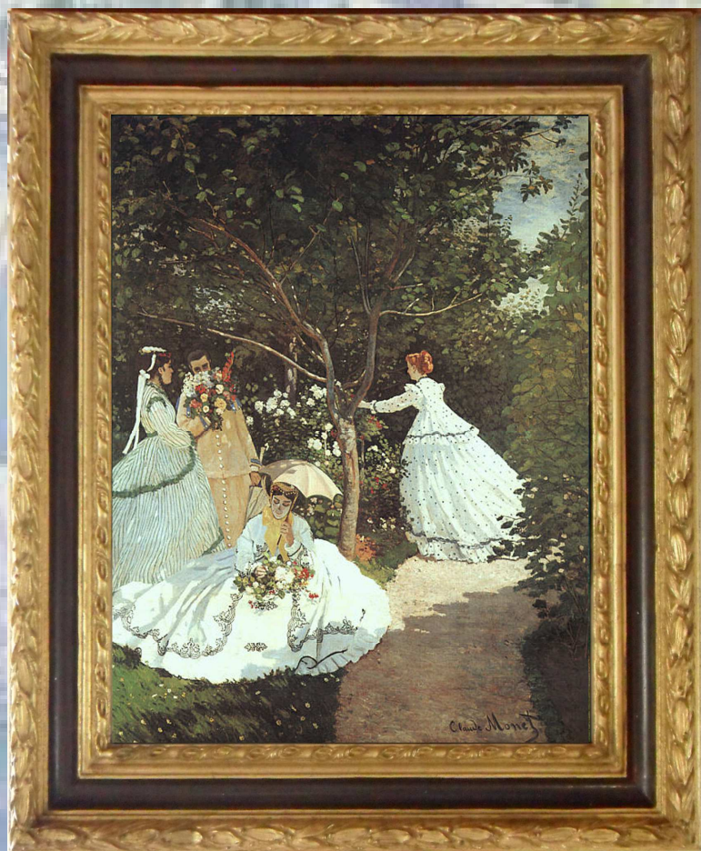
Woman in the garden, 1867 Oil on canvas, 255 x 205 cm Musée d'Orsay