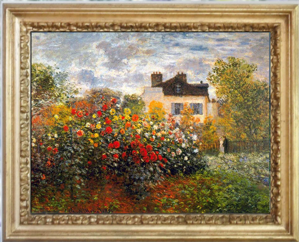
Monet's Garden in Argenteuil, 1873