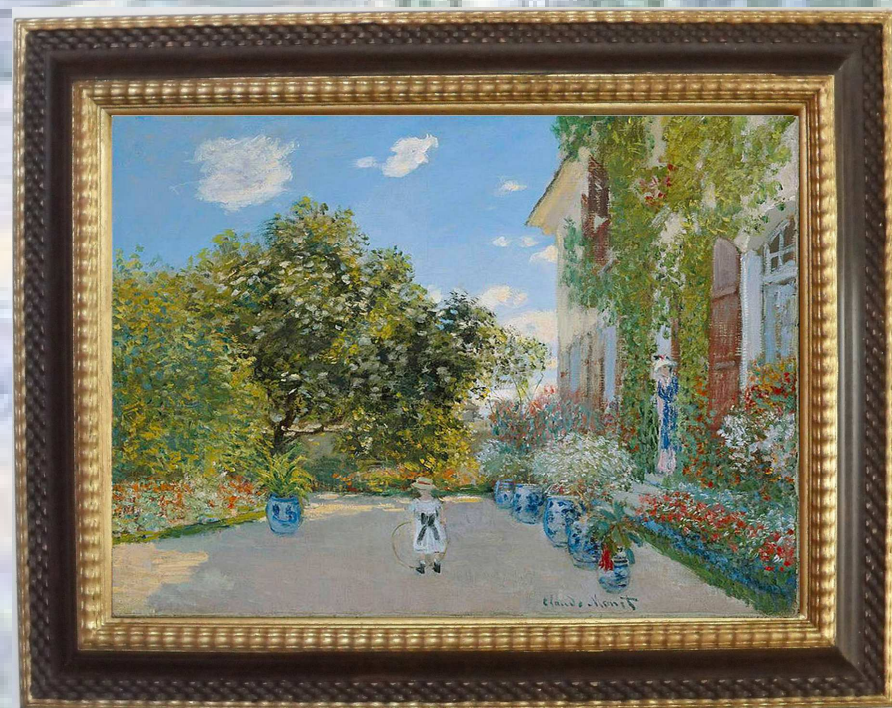
The Artist's House, 1873 Oil on canvas 60.2 × 73.3 cm Chicago Art Institute