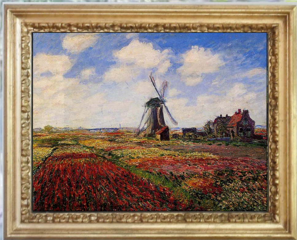
Tulip Fields With The Rijnsburg Windmill 1886 Oil on canvas 65.6 x 81.5 cm Private collection