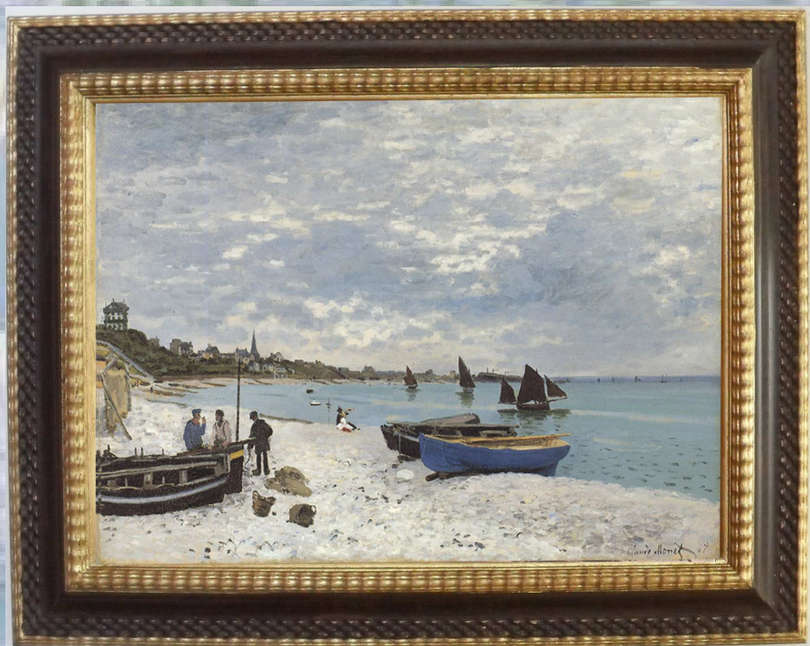
The Beach at Sainte-Adresse, 1867 Oil on canvas, 75.8 x 102.5cm The Art Institute of Chicago