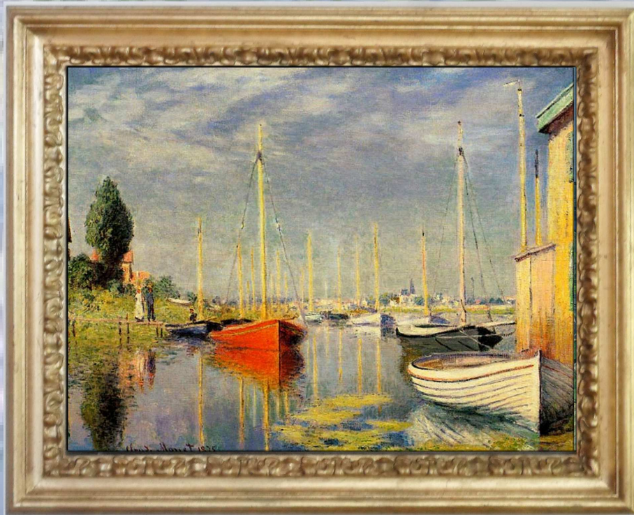
Red Boats at Argenteuil, 1875 Oil on canvas 56x67 cm Musée de l'Orangerie