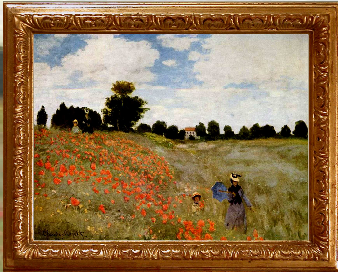
Poppies ,1873 Oil on canvas 50 x 65 cm Musée d'Orsay