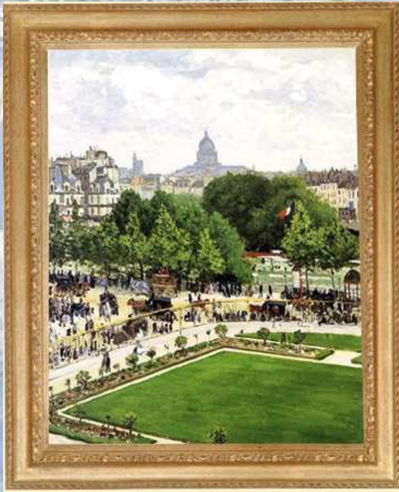
The garden of the Princess, 1867 Oil on canvas 61.9 x 91.8 cm. Allen Memorial Art Institute