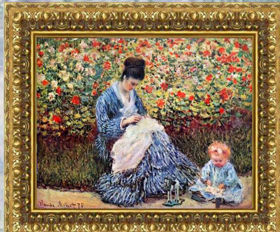
Madame Monet with her son, 1875 Oil on canvas