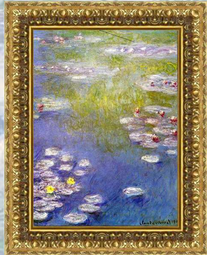
Water Lilies, 1908 Oil on canvas 92x89 cm. Private Collection