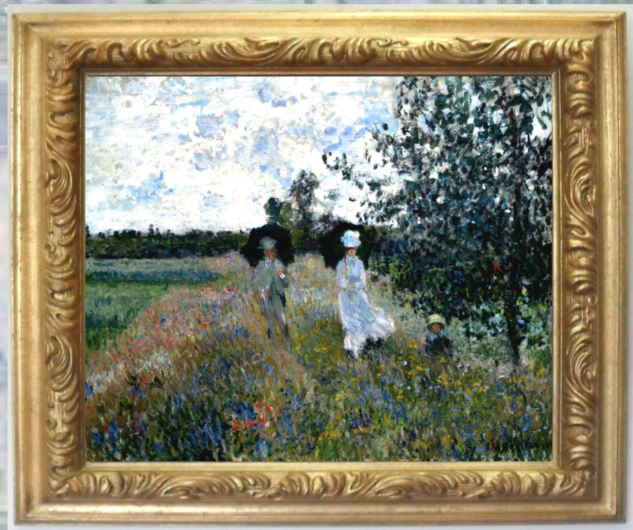
Promenade near Argenteuil, 1873 Oil on canvas, 81x60 Musee Marmottan