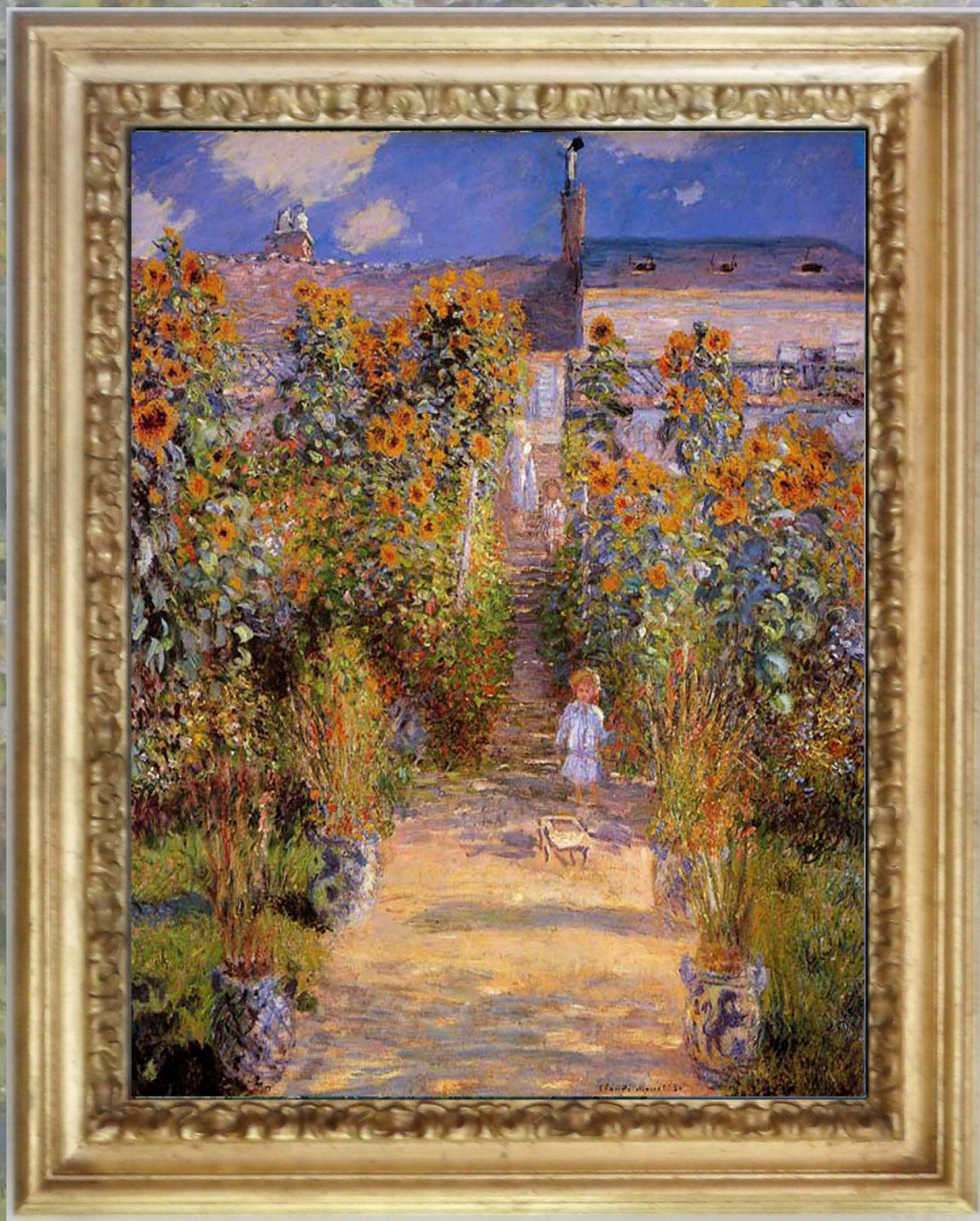
The Artist's Garden at Vétheuil , 1880 Oil on canvas, 151.5 x 121 cm Alisa Melon Bruce Collection