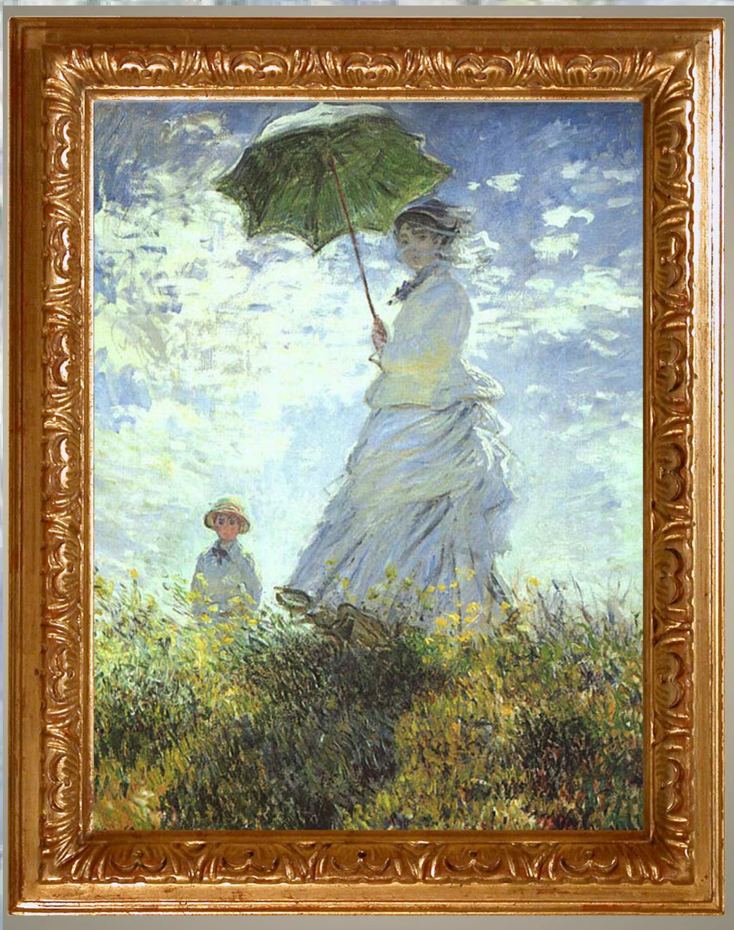
Woman with a parasol, 1875 Oil on canvas 98.1 cm cm × 129.9 cm National Gallery of Art