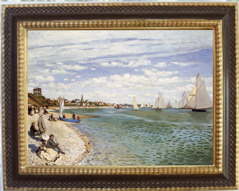
Beach at Saint Adresse, 1867 Oil on canvas 75.5 x 102.5cm Art Institute of Chicago, Chicago