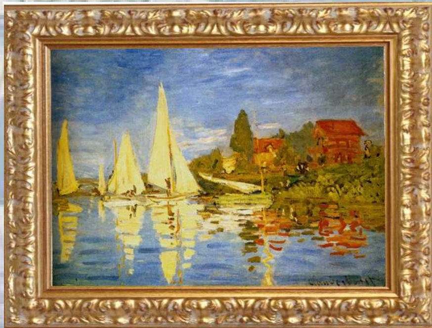
Regattas at Argenteuil , 1872