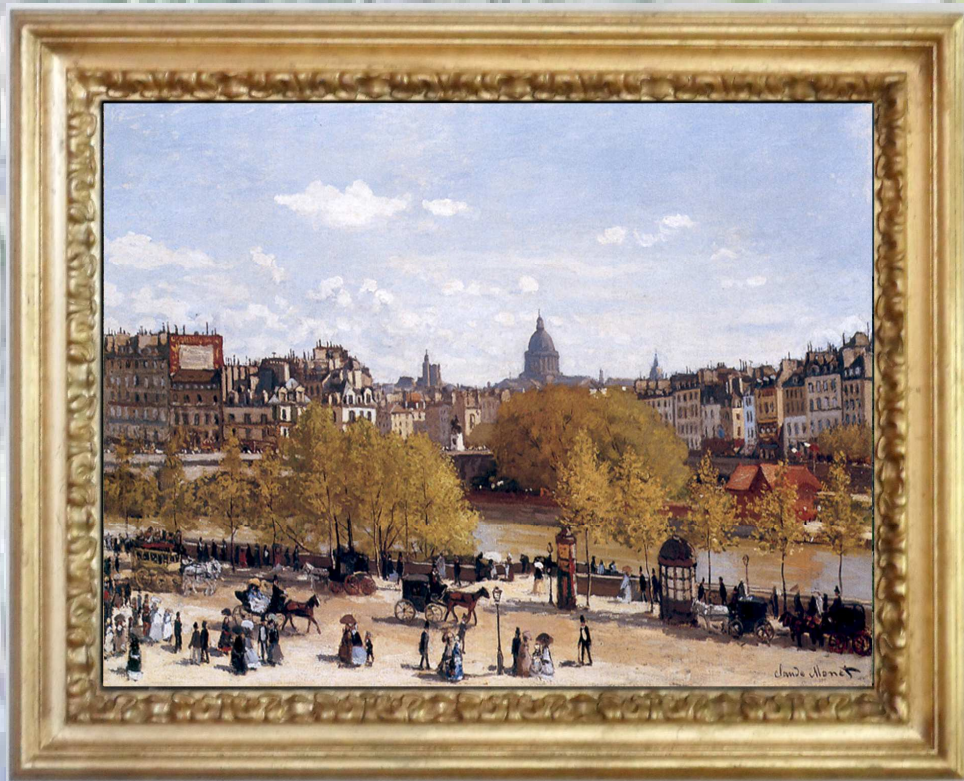
The Quai at the Louvre, 1867 Oil on canvas 65 x 93 cm Haags Gemeentemuseum, The Hague