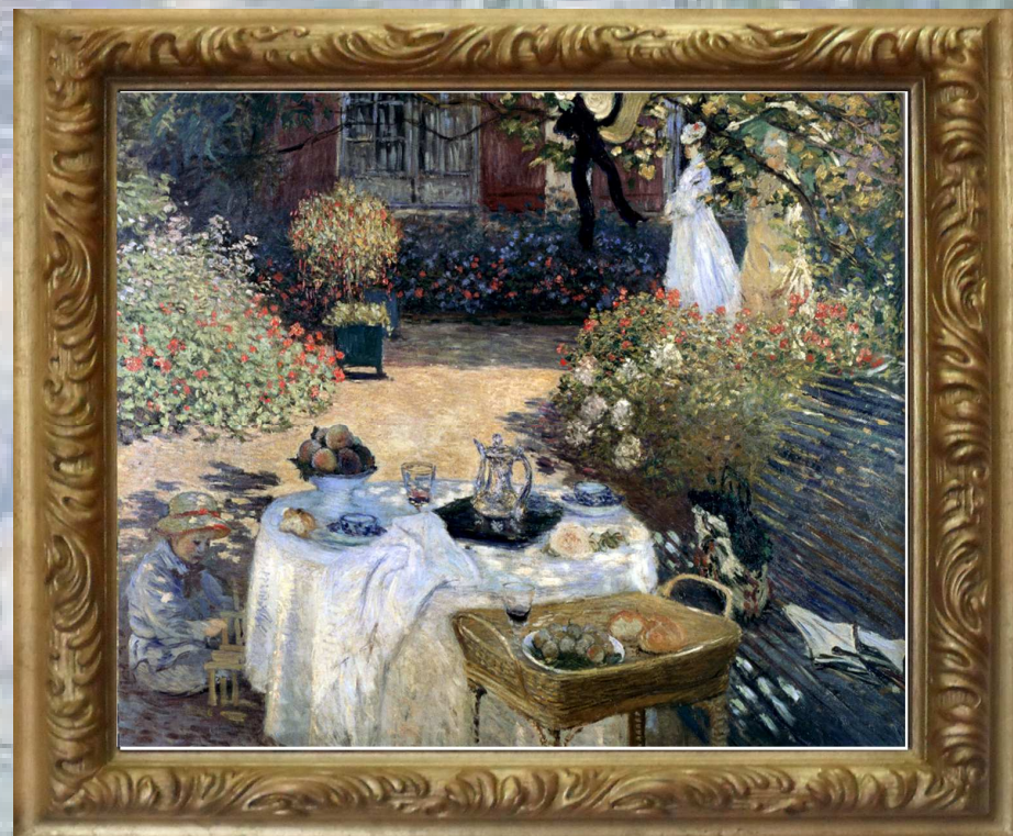
The Luncheon, Monet's Garden at Argenteuil , 1873 Private collection