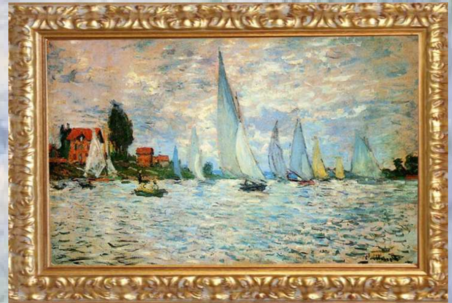
Regattas at Argenteuil, 1872 Oil on canvas 48 x 75 cm Musée d'Orsay