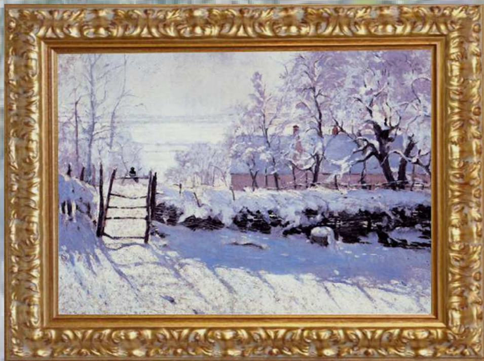
The Magpie Between 1868 and 1869 Oil on canvas 89 X 130 cm Musée d'Orsay