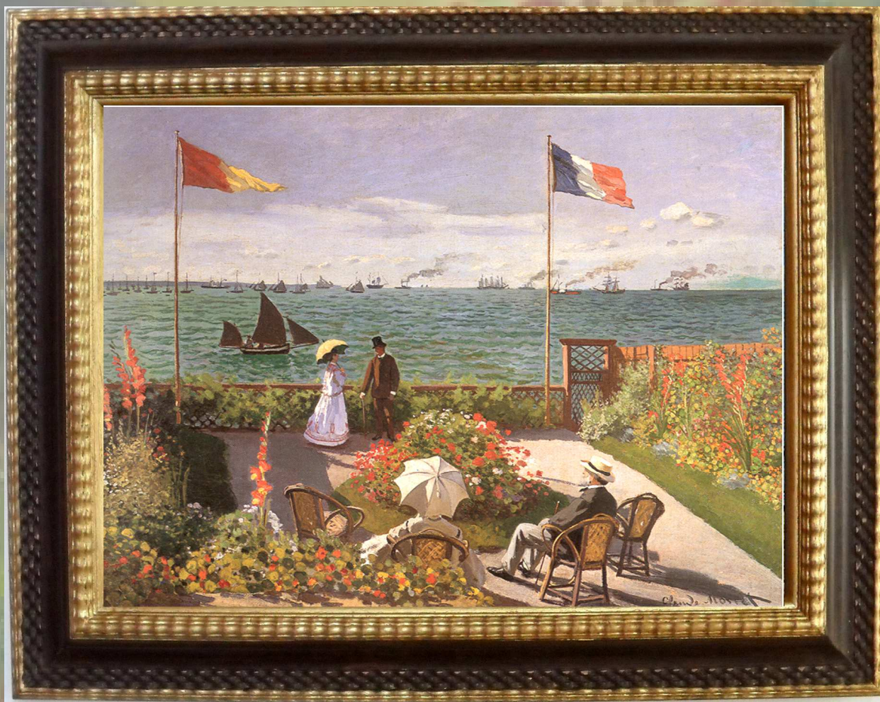
Garden at Sainte-Adresse, 1867 Oil on canvas 98.1 cm cm × 129.9 cm N.Y Metropolitan Museum of Art