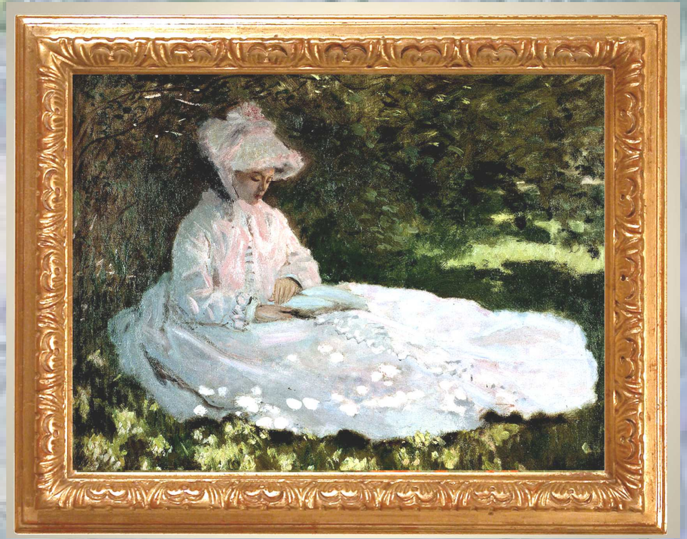
Camille Reading, 1872 Oil on canvas 50 x 65 cm Walters Art Gallery, Baltimore