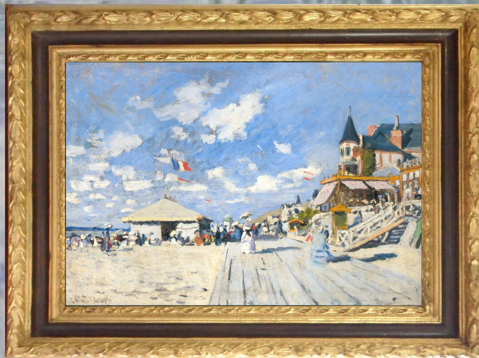
Sur les planches de Trouville