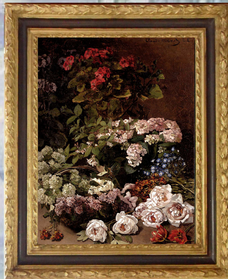
Spring Flowers, 1864 Oil on canvas 91 x 116.8 cm Cleveland Museum of Art, OH, USA