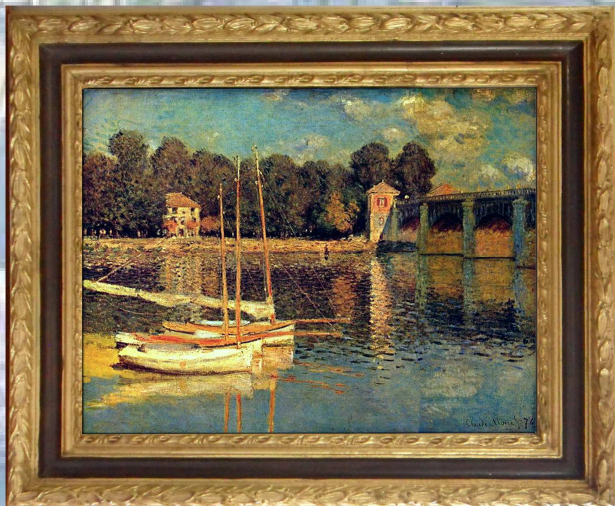
The Bridge at Argenteuil, 1874 Oil on canvas, 60x80 Louvre Paris