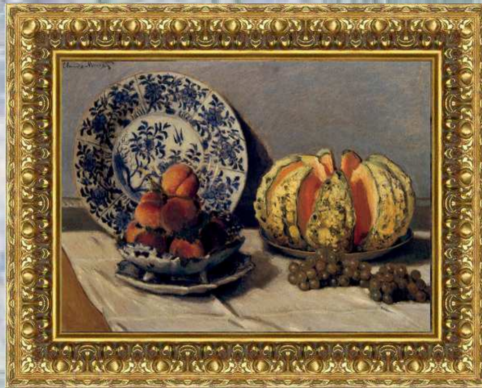
Still life with melon, 1872 Oil on canvas, 53 x 73 cm. Museum Gulbekian