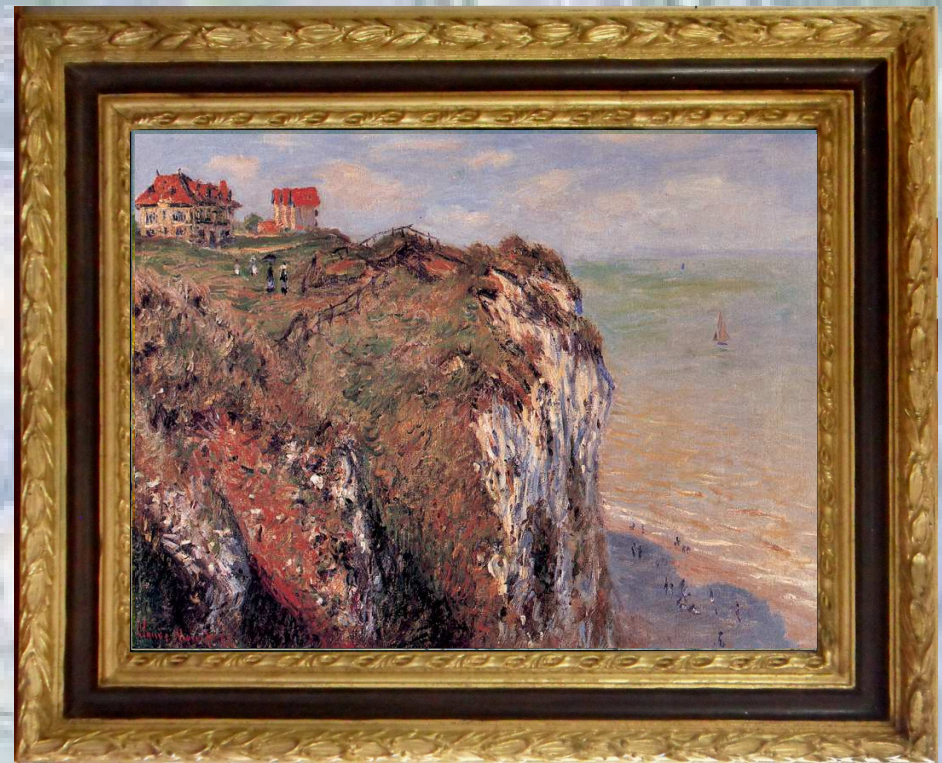
Cliffs at Dieppe, 1882 Oil on canvas 65 x 81 Kunsthaus Zurich, Zurich