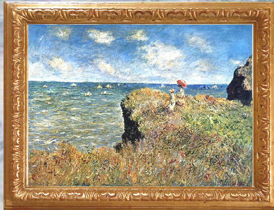
The Cliff Walk, Pourville